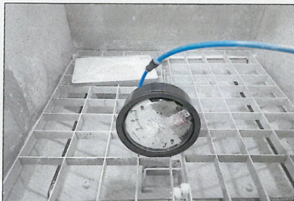
[Fig. 3: IP 6X]