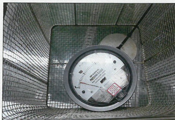
[Fig. 4: IP X7]