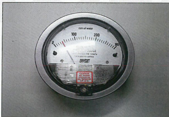
[Fig. 1: Front]